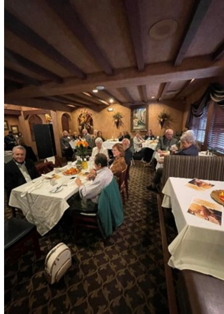
Retirement Luncheon at the Artisan Restaurant in Toms River