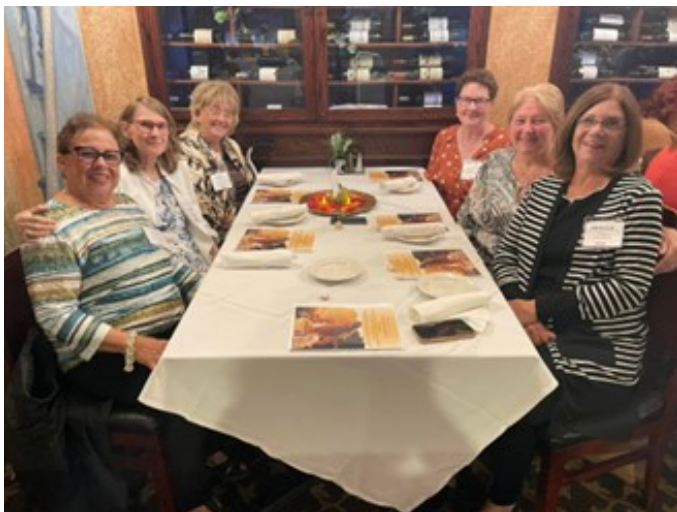
LACEY AGLOW LEADERS