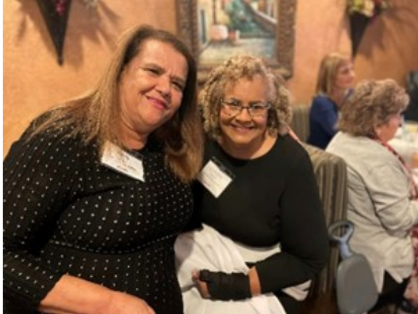
Middletown Aglow Leaders